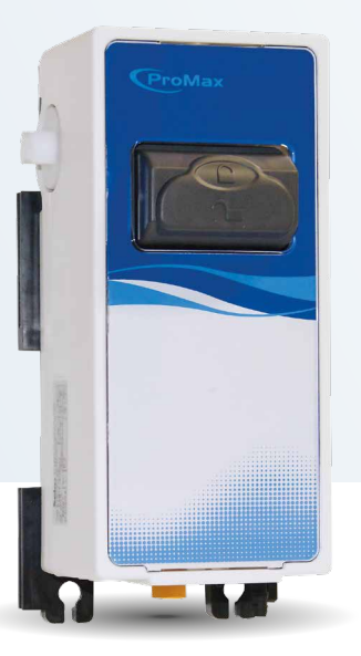
ProMax Slide 1 Product