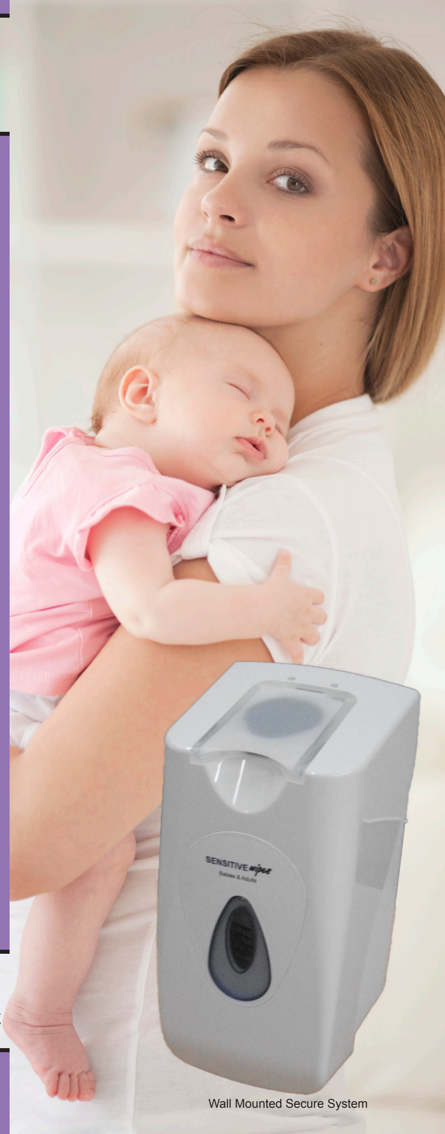
Wall Mounted Secure System

N A T I O N W I D E 1300 EQUIPE (378 473) www.equipesolutions.com.au